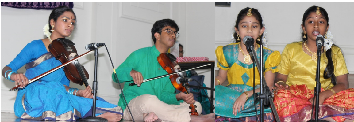
Some of the grand children performing at the stage