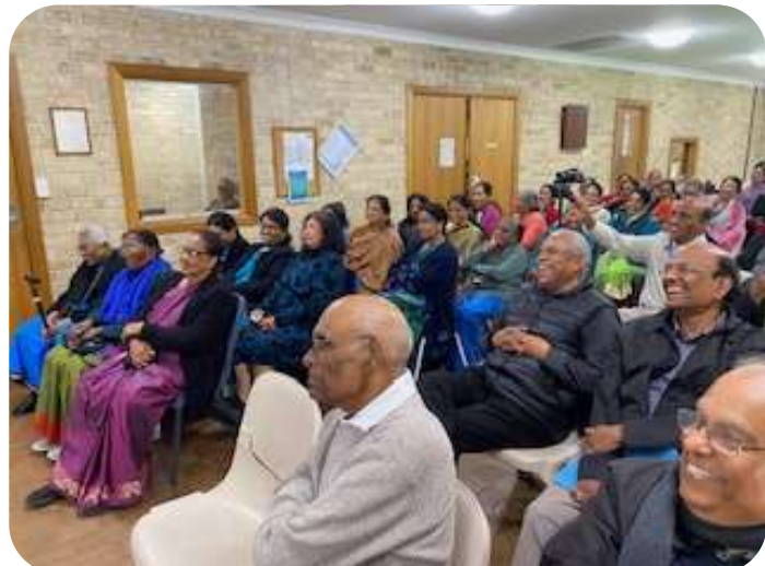
Audience enjoying the humour and comedy .