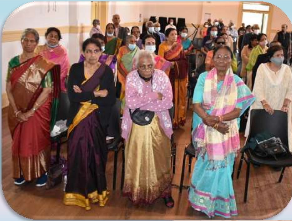
Our members at the AGM 2022

Standing in salute for the National Anthem of Australia