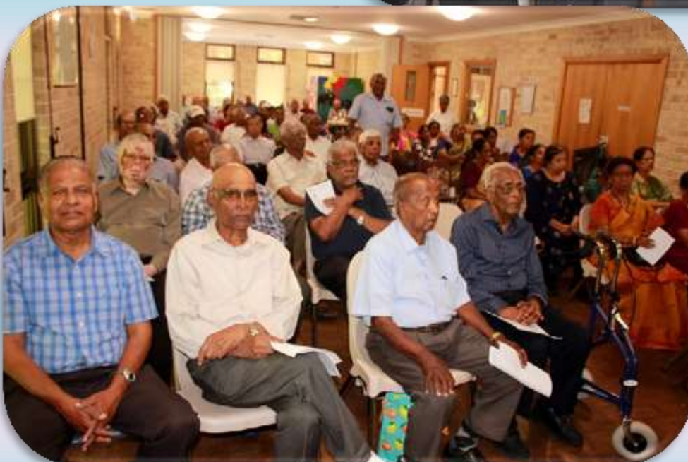
Members at the AGM of BENSOC - 2023