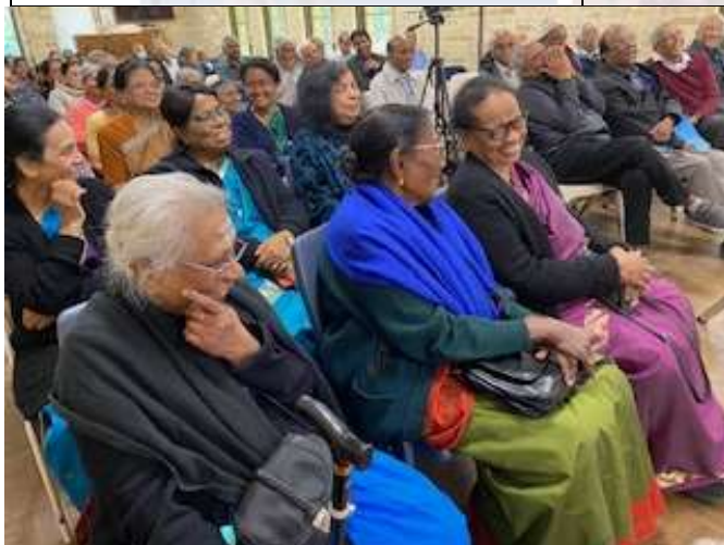
It was really a day full of fun and laughter