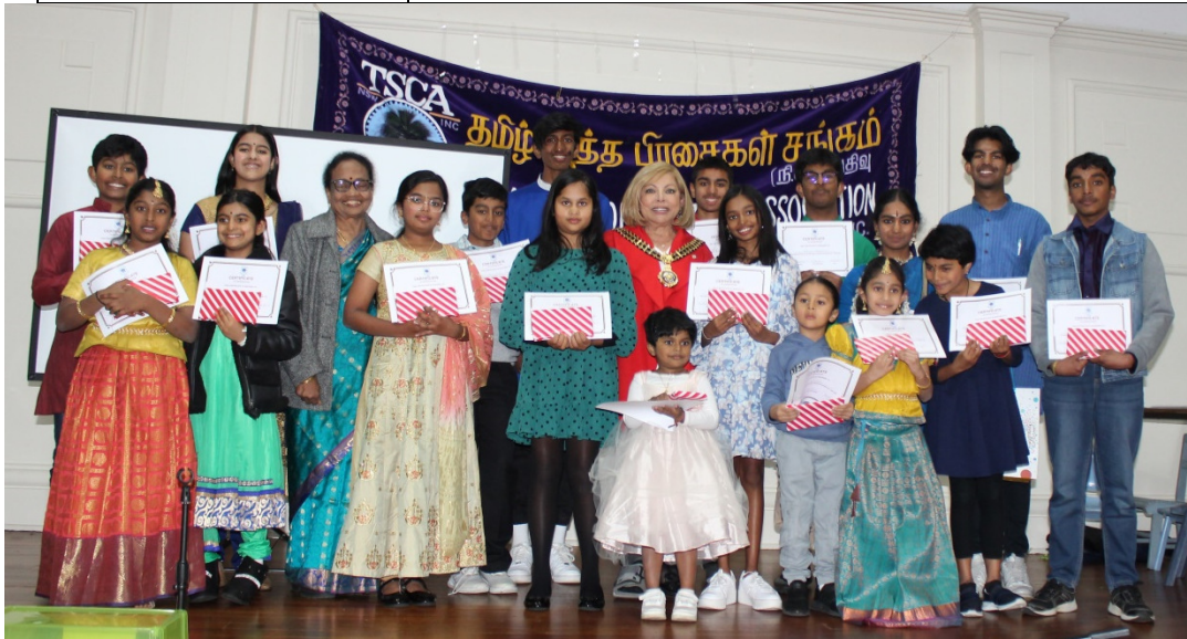
Grandchildren proudly holding their certificates.