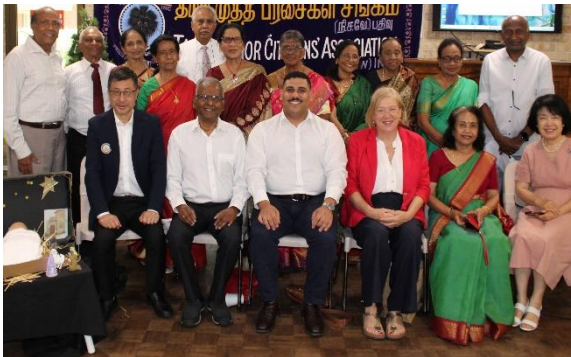
12.12.24 – நத்தார் தின கொண்டாட்டங்கள்