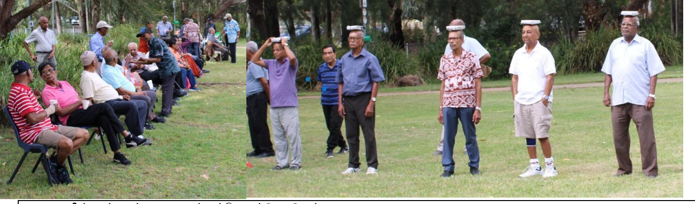
தலையில் புத்தகத்தை வைத்துக்கொண்டு ஓடுதல்.