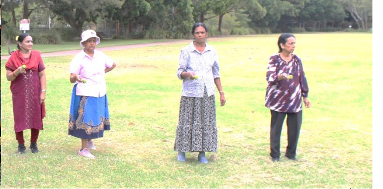
கரண்டியில் தேசிக்காயை வைத்துக்கொண்டு ஓடுதல் (Lime & Spoon) பேரப்பிள்ளைகள் தினம் (GRAND CHILDREN'S DAY)