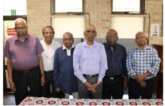
Executive Committee 2024