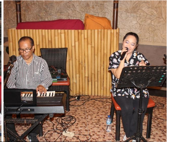
Hotel entertaining us