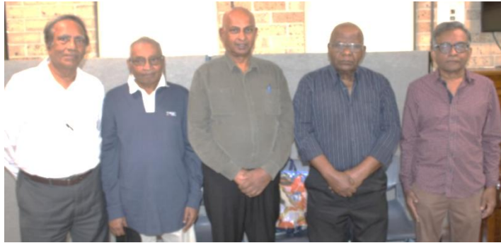
Executive Committee 2025